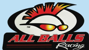
Small Decal Part#82-4011