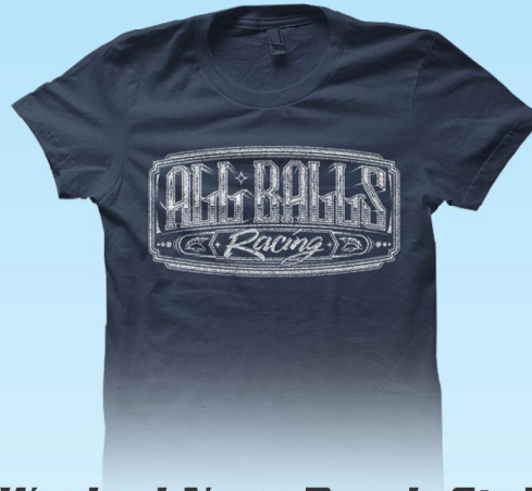
Washed Navy Beach Style