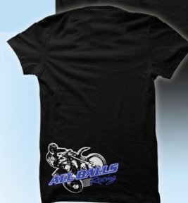
Black/Blue Whip S, M, L, XL Part#82-2001