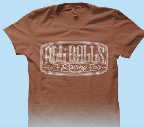
Clay Beach Style