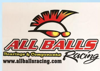
Racing Banner 26" X 30.5" Part#82-4009