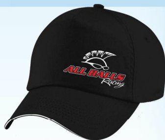
Black & White Cap Adjustable Part#82-2004