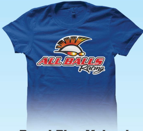
Royal Blue Mohawk