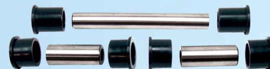
All Balls Upgraded Kit

50-1059 | KVF650, 2006-13 | KVF750, 2005-11