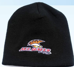
Beanie Hat Part#82-2005