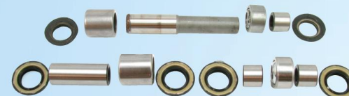
OEM Kit / All Balls Replacement Kit