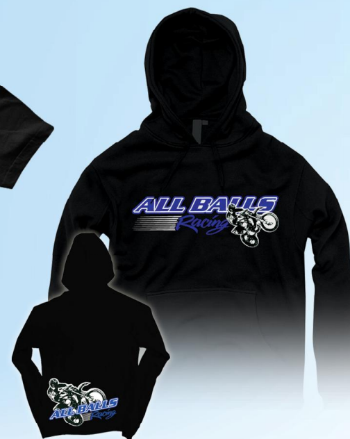
Black/Blue Whip Hoodie S, M, L, XL Part#82-1016